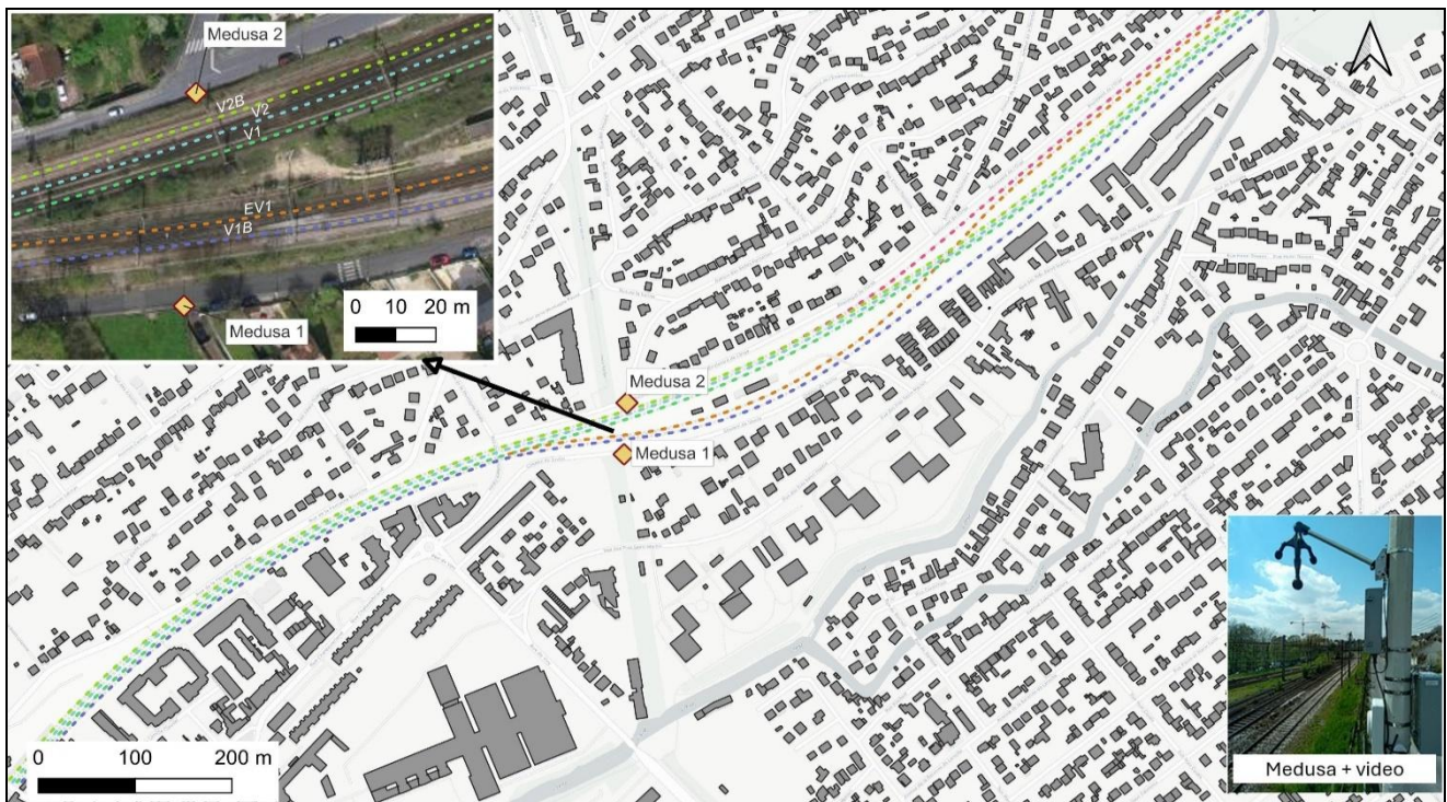
Figure 1: Location and Setup of Medusas Sensors for Railway Noise Detection

Furthermore, two cameras were deployed with the medusas, the cameras were AI 360° Panoramic Fisheye Network Camera MS-C9674. It automatically detects when an object is moving and saves the video. It allowed us to have a complementary dataset of each train's pass-by videos.